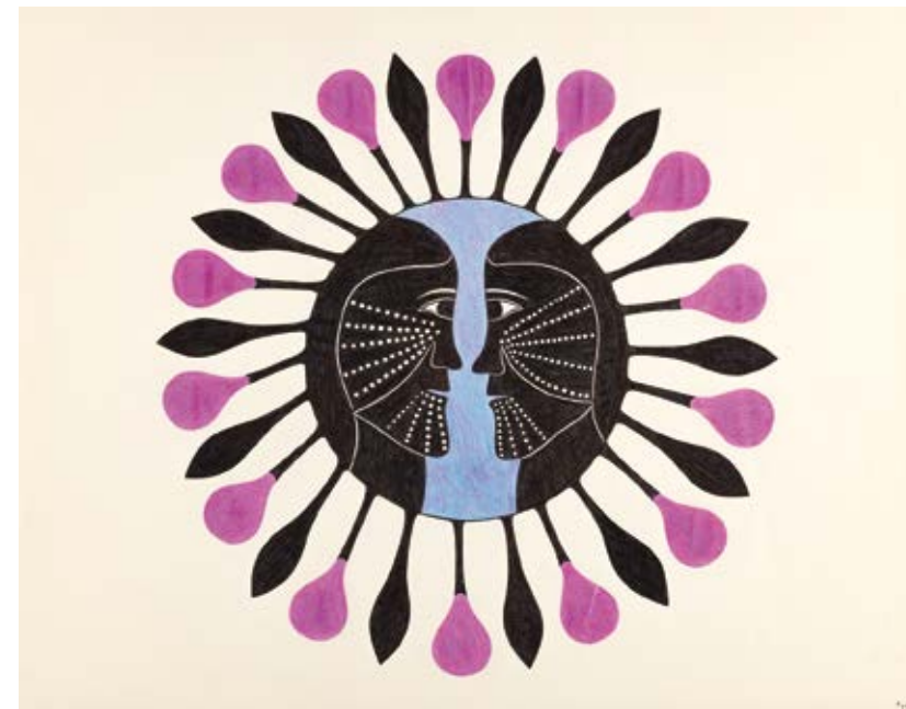
38 KENOJUAK ASHEVAK, C.C., R.C.A. (1927-2013) f., KINNGAIT (CAPE DORSET), Untitled (Opposing Tattooed Faces) , c. 1994-95, coloured pencil, felt tip pen, and graphite drawing, 20 x 26 in (50.8 x 66 cm), signed: "P. Q. <math>\text{ᐱᐱ}</math>".