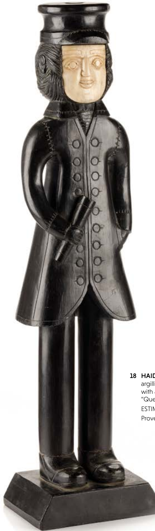
18 HAIDA ARTIST, Sea Captain Figure , c. 1840s or 1850s, argillite and bone, 16.75 x 4.5 x 3.25 in (42.5 x 11.4 x 8.3 cm), with affixed handwritten label, in an unknown hand: "Queen Charlotte / Island / BC / [indistinct - To: ?all?]". ESTIMATE: $50,000 / $80,000 Provenance: A British Columbia Private Collection.