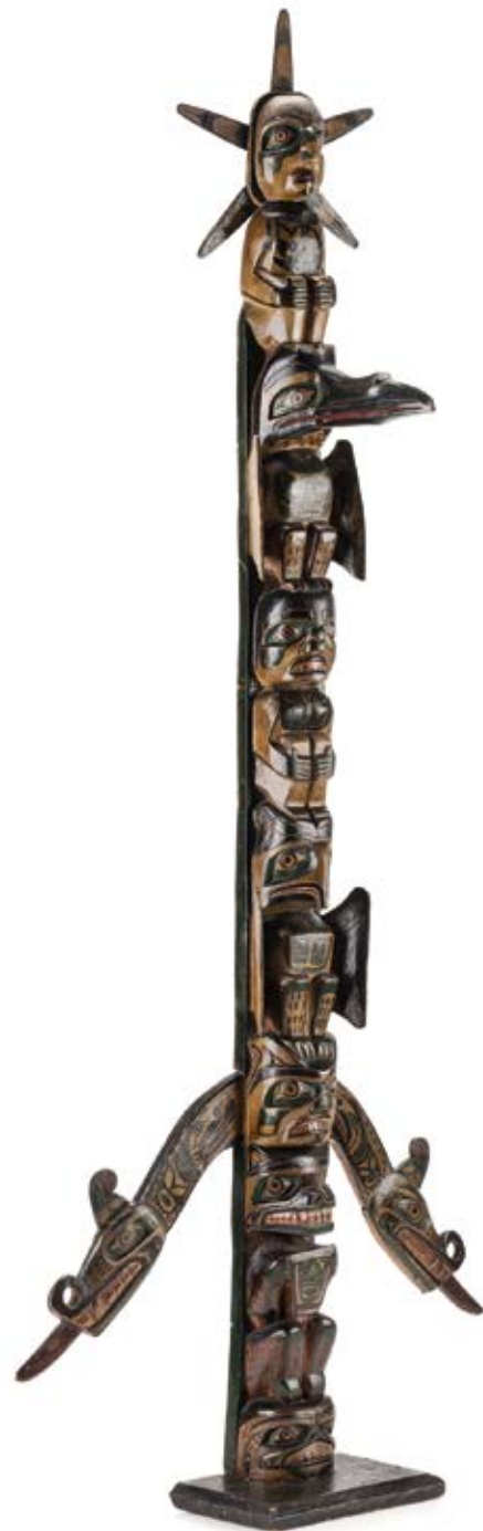
108 KWAKWAKA'WAKW ARTIST, Model Totem Pole, c. 1890-1910, wood and pigment, 49.25 x 20.5 x 7.75 (125.1 cm x 52.1 x 19.7 cm), unsigned.