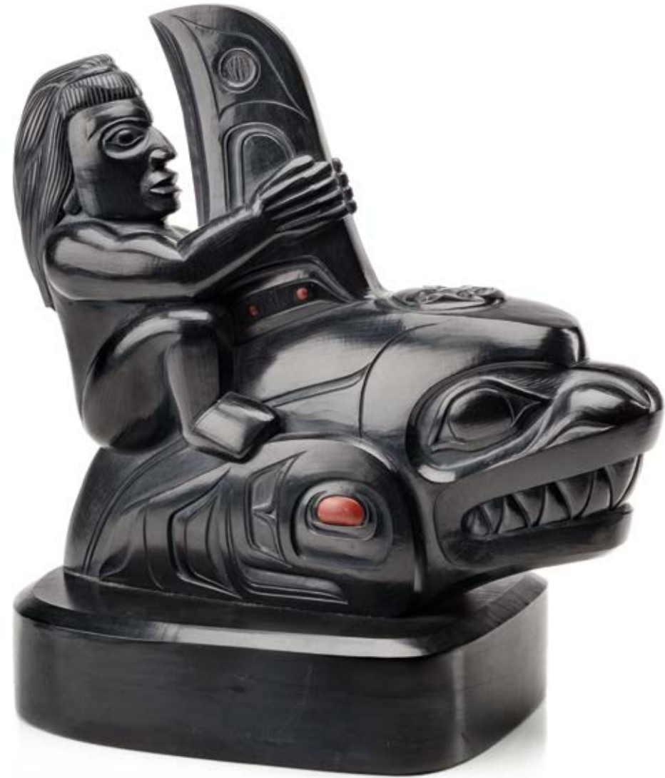
43 CHRISTIAN WHITE (1962-), OLD MASSET, HAIDA GWAII, Sgaan (Supernatural Being) , 2007, argillite and catlinite, 9.5 x 7.75 x 4.75 in (24.1 x 19.7 x 12.1 cm), titled, signed with artist's stylized initials, dated, and inscribed: "Sgaan" / Supernatural being / CW 07 / Haida Gwaii". ESTIMATE: $12,000 / $18,000

Provenance: Acquired directly from the artist by the present Private Collection, UK; accompanied by a photo of the artist holding the work.