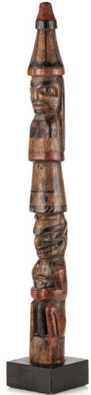
59 KWAKWAKA'WAKW ARTIST , Model Totem Pole , c. 1915-1925, wood and acrylic paint, 25.25 x 2.5 x 2.75 in (64.1 x 6.3 x 7 cm); with later added base: 27.25 x 4.25 x 4.25 in (69.2 x 10.8 x 10.8 cm).