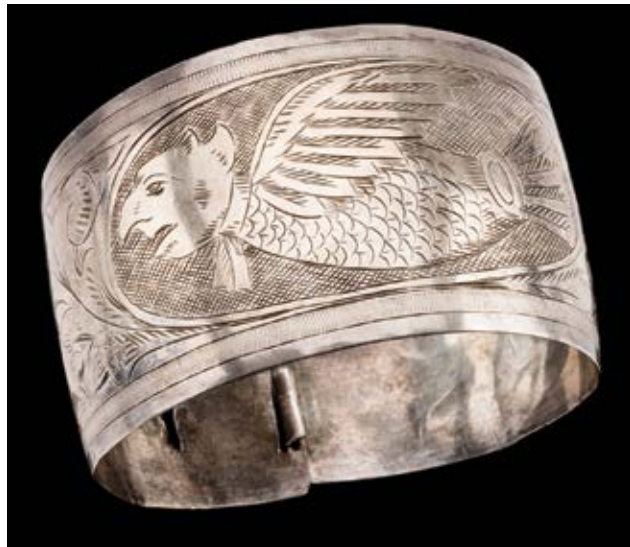
113 HAIDA ARTIST, Bracelet with Hybrid Beast Motif , c. 1880s, carved and engraved hammered coin silver, 21 g, interior circumference: 7 in (17.8 cm), (with later added secondary clasp: 5.75 in (14.6 cm), overall: 1.5 x 2.75 x 2 in (3.8 x 7 x 5.1 cm).