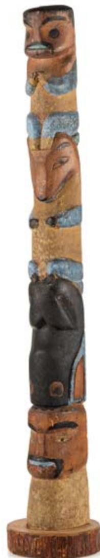
109 NUU-CHAH-NULTH ARTIST, Model Totem Pole, c. 1915, wood and paint, 23 x 4 x 4 in (58.4 x 10.2 x 10.2 cm), unsigned.