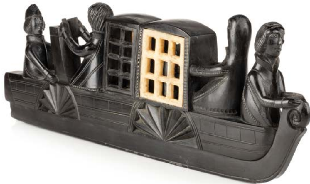
54 HAIDA ARTIST, Ship Panel Pipe , c. 1840s or 1850s, argillite and bone, 4.25 x 12 x 1 in (10.8 x 30.5 x 2.5 cm). ESTIMATE: $20,000 / $30,000 Provenance: A British Columbia Private Collection.