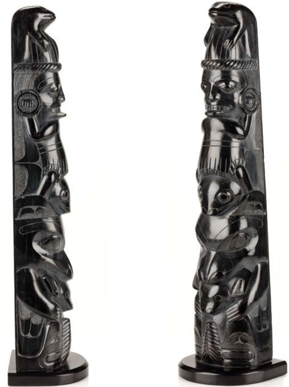
55 HAIDA ARTIST, Model Totem Pole , c. 1880s, argillite, 13 x 3.5 x 3 in (33 x 8.9 x 7.6 cm). ESTIMATE: $7,000 / $10,000 Provenance: A Vancouver Collection.