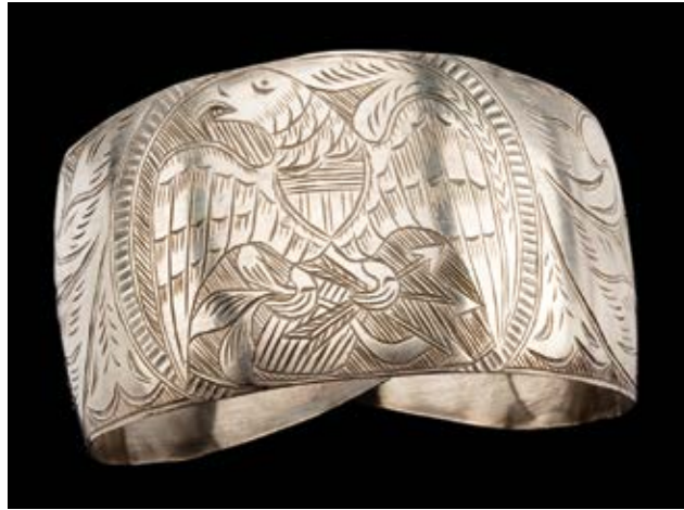
112 HAIDA ARTIST, Bracelet with American Eagle Motif , c. 1880s, carved and engraved hammered coin silver, 22 g, interior circumference: 7 in (17.8 cm), overall: 1.5 x 2 x 2.5 in (3.8 x 5.1 x 6.3 cm).