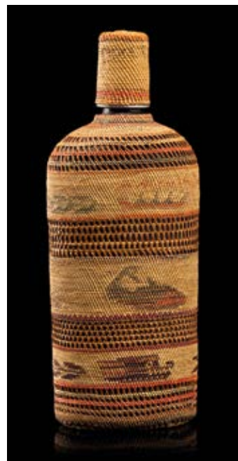
114 NUU-CHAH-NULTH ARTIST, Basketry Woven Macallan Whisky Bottle , c. 1920, glass bottle, tin cap, natural and dyed grass, and cedar bark, 10.25 x 4.25 x 2.75 in (26 x 10.8 x 7 cm).