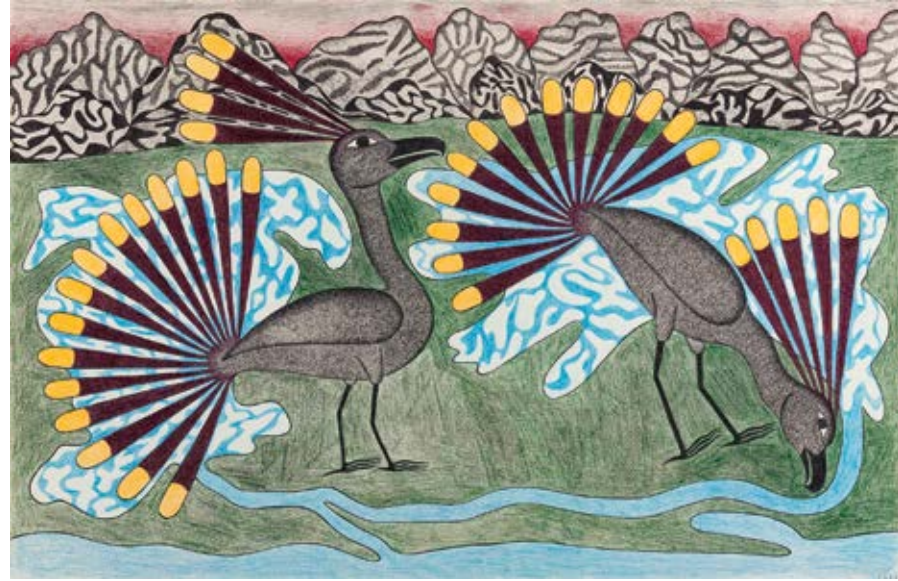
12 KENOJUAK ASHEVAK, C.C., R.C.A. (1927-2013) f., KINNGAIT (CAPE DORSET), Two Ravens on the Land , c. 1997-98, graphite, coloured pencil, and pentel, 26 x 40 in (66 x 101.6 cm), signed: "P ᐃᐱᐱ". ESTIMATE: $6,000 / $9,000