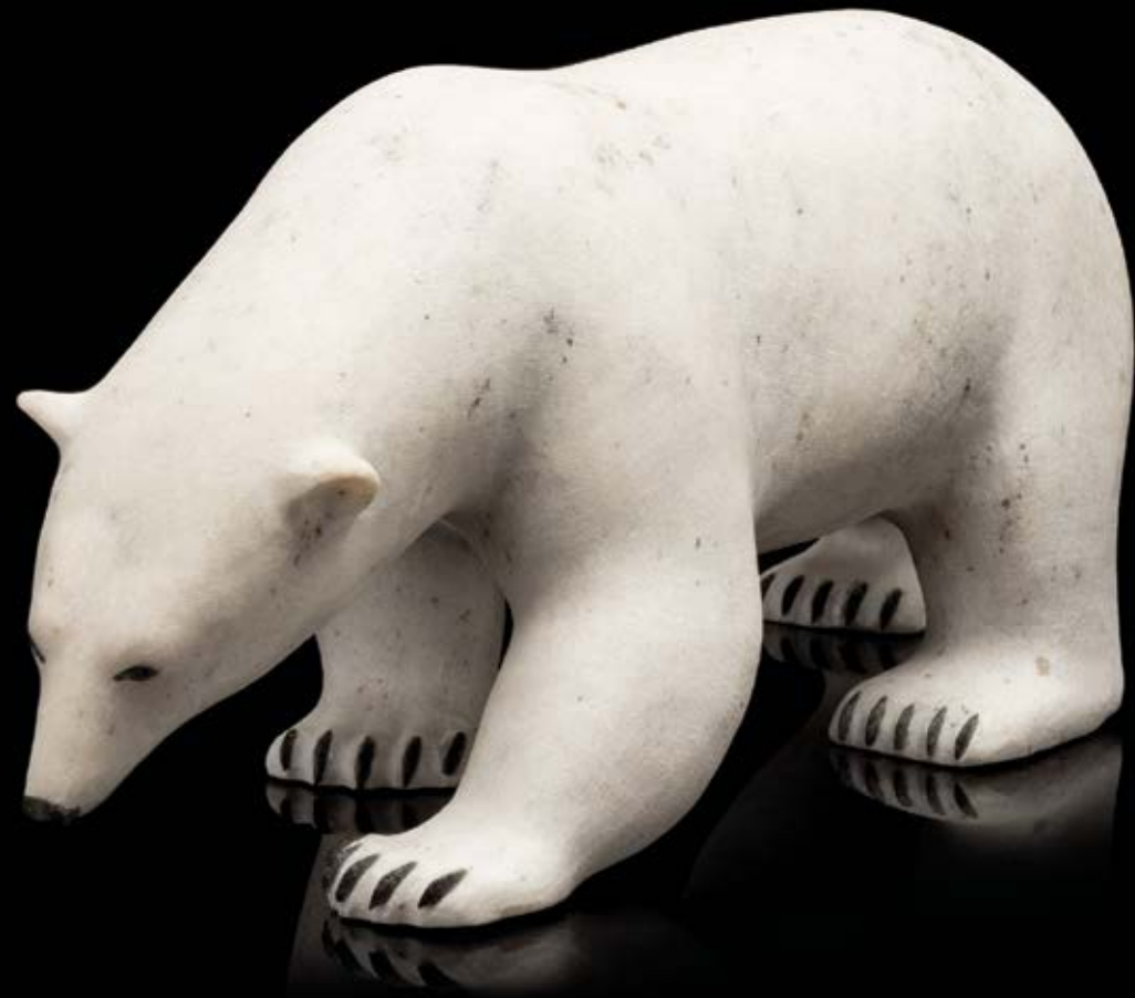
40 PAUL QUVIQ MALLIKI (1956-), NAUJAAT (REPULSE BAY), Walking Bear , 1999, marble with black stone inlay, 5.75 x 15 x 5.25 in (14.6 x 38.1 x 13.3 cm), signed and dated: "PAUL MALLIKI / ᑭᑦᑲᑦ / 99 21". ESTIMATE: $8,000 / $12,000

Provenance: Private Collection, Alberta.