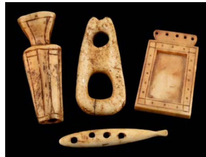
117 HISTORIC PERIOD INUIT OR POSSIBLY THULE CULTURE MAKERS, Implements and Amulets , c. 19th century or earlier, ivory, bone, and pigment, largest: 2 x 0.75 x 0.5 in (5.1 x 1.9 x 1.3 cm).

While Luke Anowtalik is perhaps best known as a stone sculptor, many of our favourite works by the artist are his caribou antler compositions. As a member of the Ahiarmiut (inland Caribou Inuit), Anowtalik had a natural affinity to the animal, but clearly the varied shapes and carvability of caribou antler also seem to allow his imagination to run free. Unlike his monolithic stone works, Anowtalik's antler sculptures are almost always constructed of numerous elements joined together in various ways. We wonder whether this charming scene depicts the small crowd admiring the first bird of spring, or a bird spirit. Delightful!