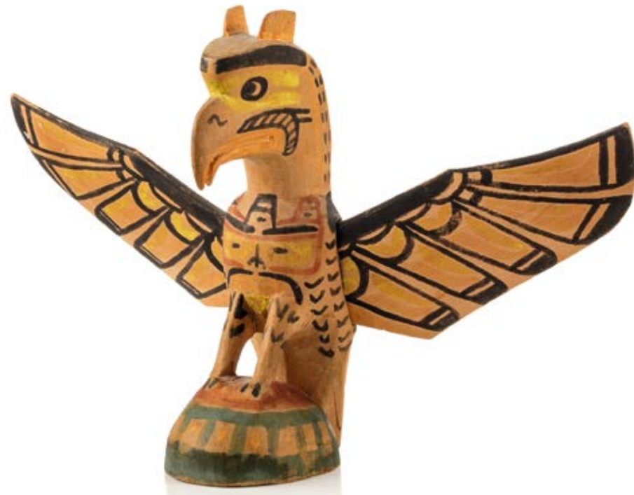
57 CHARLIE JAMES (YAKUDLAS) (1867- c.1937), KWAKWAKA'WAKW, Thunderbird Figure , c. 1920s, cedar wood and pigment, 6 x 9 x 3 in (15.2 x 22.9 x 7.6 cm), signed: "CHARLIE / JAMES"; signed again: "YAKUGLAS".